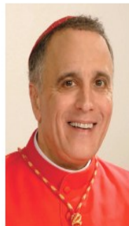
His Eminence Daniel Cardinal DiNardo PRINCIPAL CELEBRANT

Honoring the birthday of Rev. Dr. Martin Luther King, Jr.