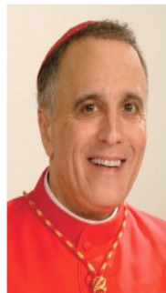
His Eminence Daniel Cardinal DiNardo PRINCIPAL CELEBRANT

Honoring the birthday of Rev. Dr. Martin Luther King, Jr.